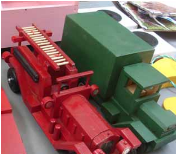
A small selection of the toys made...