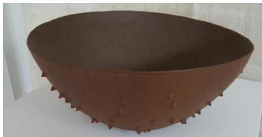
◀ Earthenware vessel on display at Kim Sacks gallery, Parkwood, Johannesburg