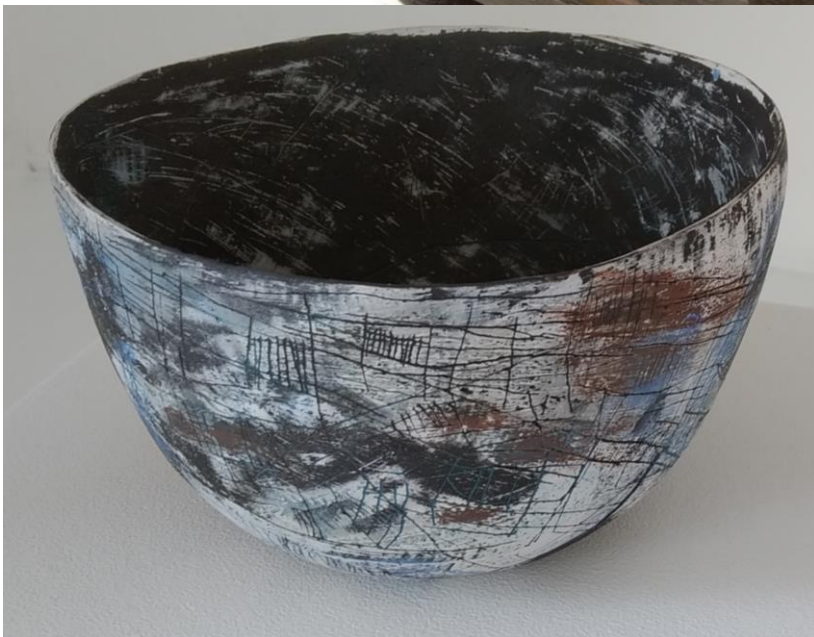
Porcelain vessel by Alistair Blair (Porcelain is difficult to work with, but rewards the effort with translucent vessels that show colours such as the painted panel with extra clarity.)