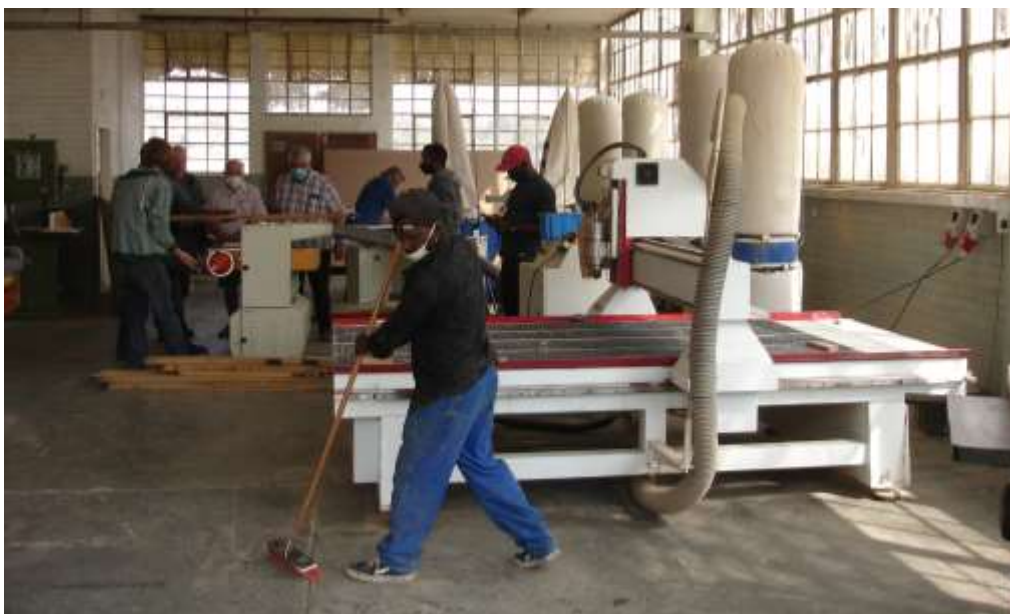
View of the woodworking shop showing the CNC router in the foreground.