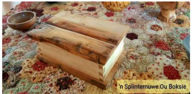
'n Splinternuwe Ou Boksie

So I decided to make a box. I had been wanting to make "antique" dovetails. The joints shown use no measuring instruments whatsoever. The only dimensions were taken from the output of my thickener (being the thickest setting that allowed all the wall pieces to be cleaned-up) as well as my bench saw (being the widest setting that made all the pieces parallel). So the depths of the pins and tails were taken from the wall edges. The positioning of the tails were judged by eye, sawn and cut out with a chisel. The pins were marked by using the corresponding set of tails. The lid comprises 5 different pieces of wood "skinned" of various scraps and glued together. I hoped I achieved an authentic appearance.