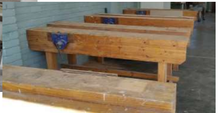
Here are our benches laid out in the woodworking shop