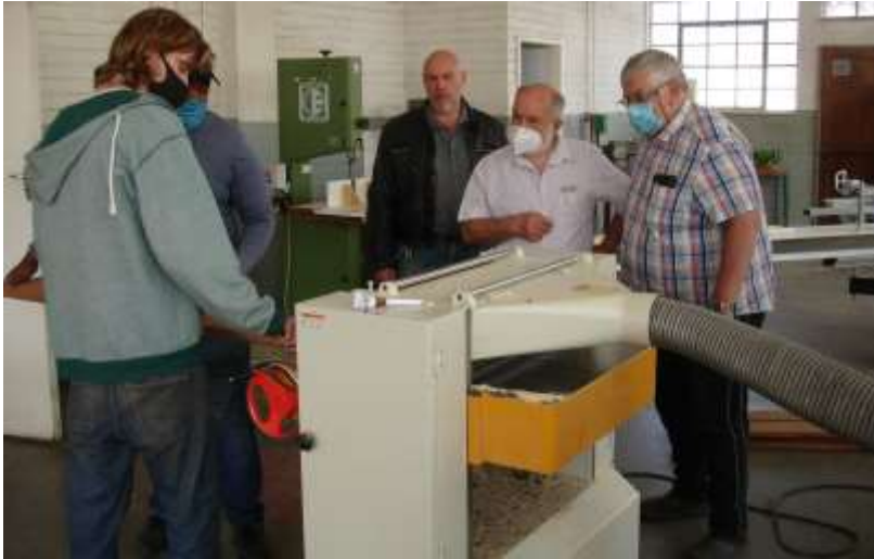
WWA members admiring the large thicknesser in the wood machining room.