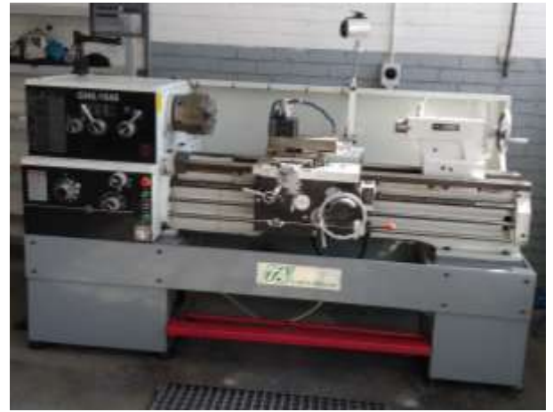
Metal centre lathe

Roll, bending brake and guillotine; Small milling machine; pipe bender/roller